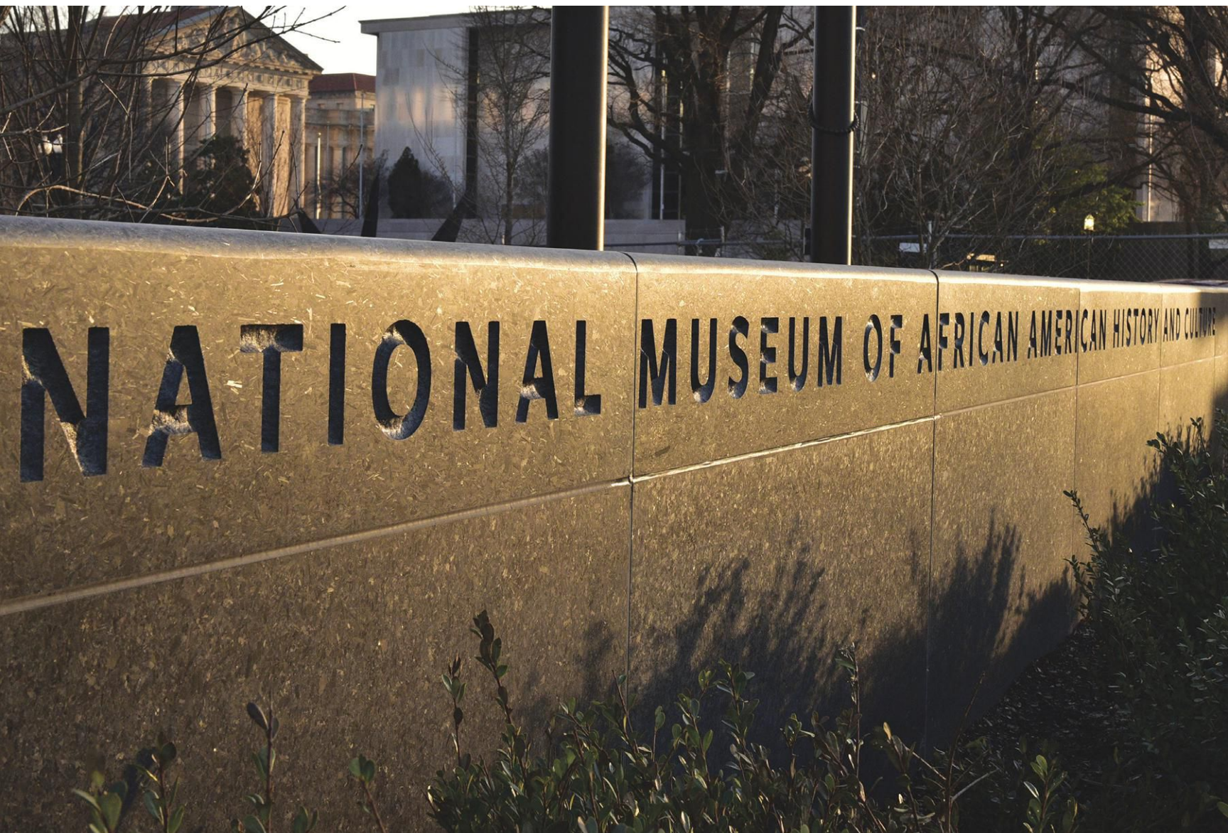
In 2009, Gustafson Guthrie Nichol (GGN), a landscape design firm with offices in Seattle and Washington, DC, won a design competition for the 5-acre site that would host the National Museum of African American History and Culture.

In 2009, Gustafson Guthrie Nichol (GGN), a landscape design firm with offices in Seattle and Washington, DC, won a design competition for the 5-acre site that would host the National Museum of African American History and Culture. The prestigious plot of land is adjacent to the Washington Monument and is bordered by Constitution Avenue, 12th Street, Madison Drive, and 14th Street in the Northwest quadrant of the city.