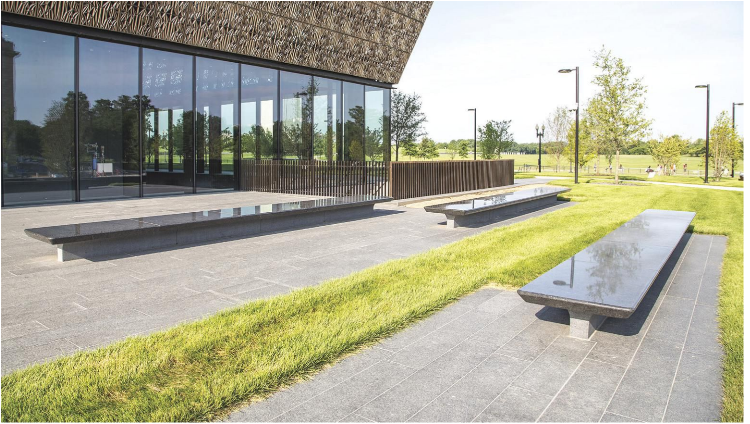
Wide benches — also rendered from Mesabi — offer the weary a place to rest. Abela said, “We made these twice as wide and in various lengths, using the same stone, but we polished the benches and expressed them as floating planes, then sculpted the supports down to a thinner leg.”