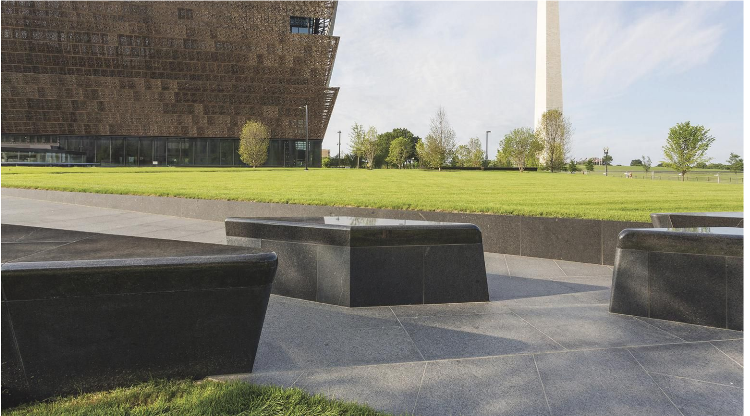
The stonework on the site includes a mix of thin and thick retaining walls, benches, bollards and pavers, rendered in two kinds of granite in four different finishes.