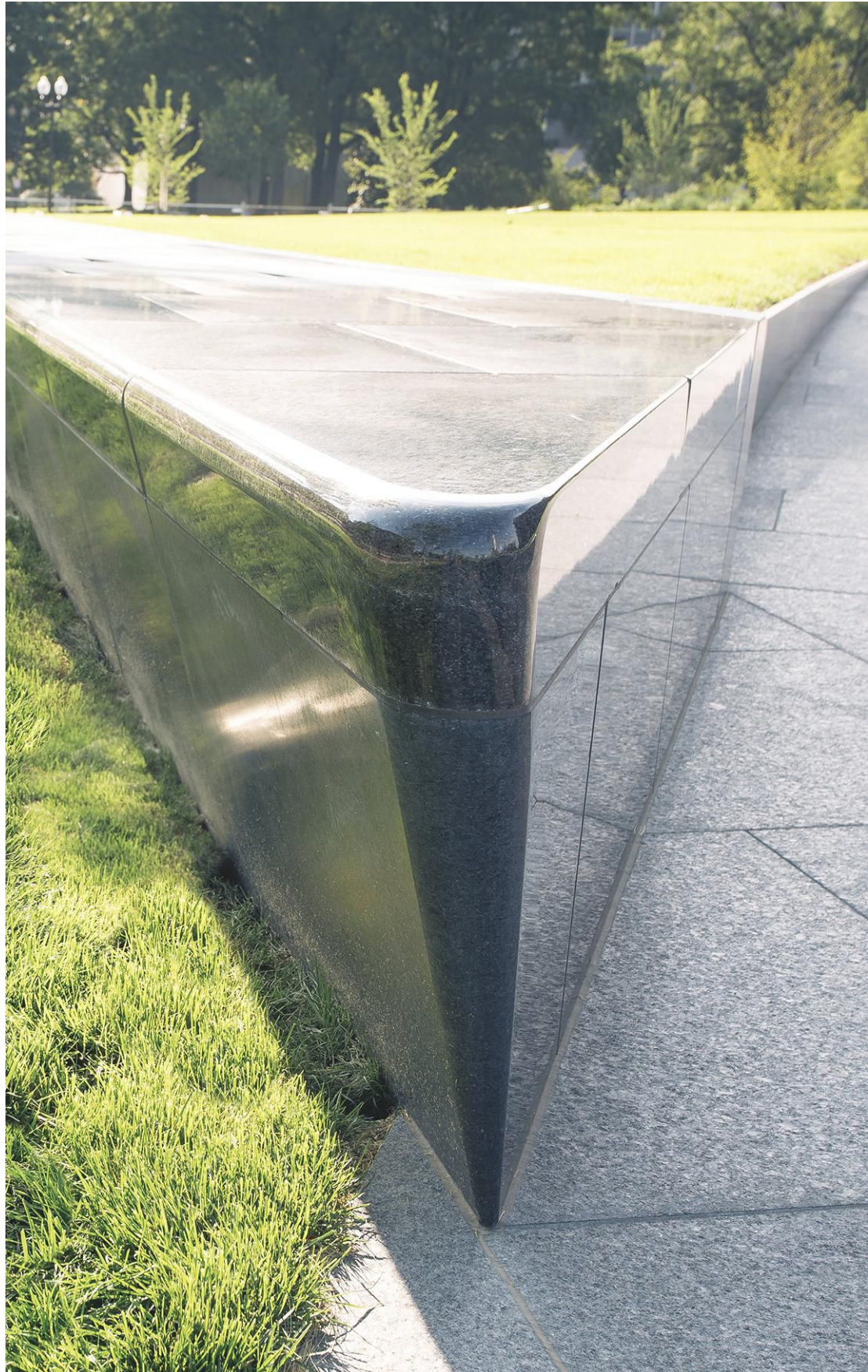
The pathway up on the north side takes you past massive trapezoids of black granite bollards topped with bullnose corners, a design detail that kept the team on its toes.