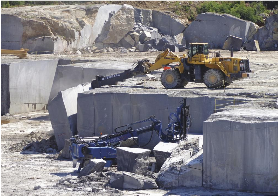
Mesabi Black® granite, quarried in Babbitt, MN, was an early choice.