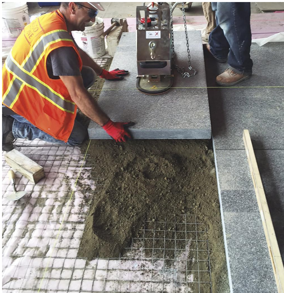
Rugo said, "A structural concrete slab on grade is typical throughout the site. There's a 6-inch slab with a 2- to 3-inch setting bed of dry pack mortar. And then 2-inch stone paving throughout, 3 inches in some cases."

blocky bulky walls into elegant pieces of art that provide a perimeter and also give definition to the limit of the property."