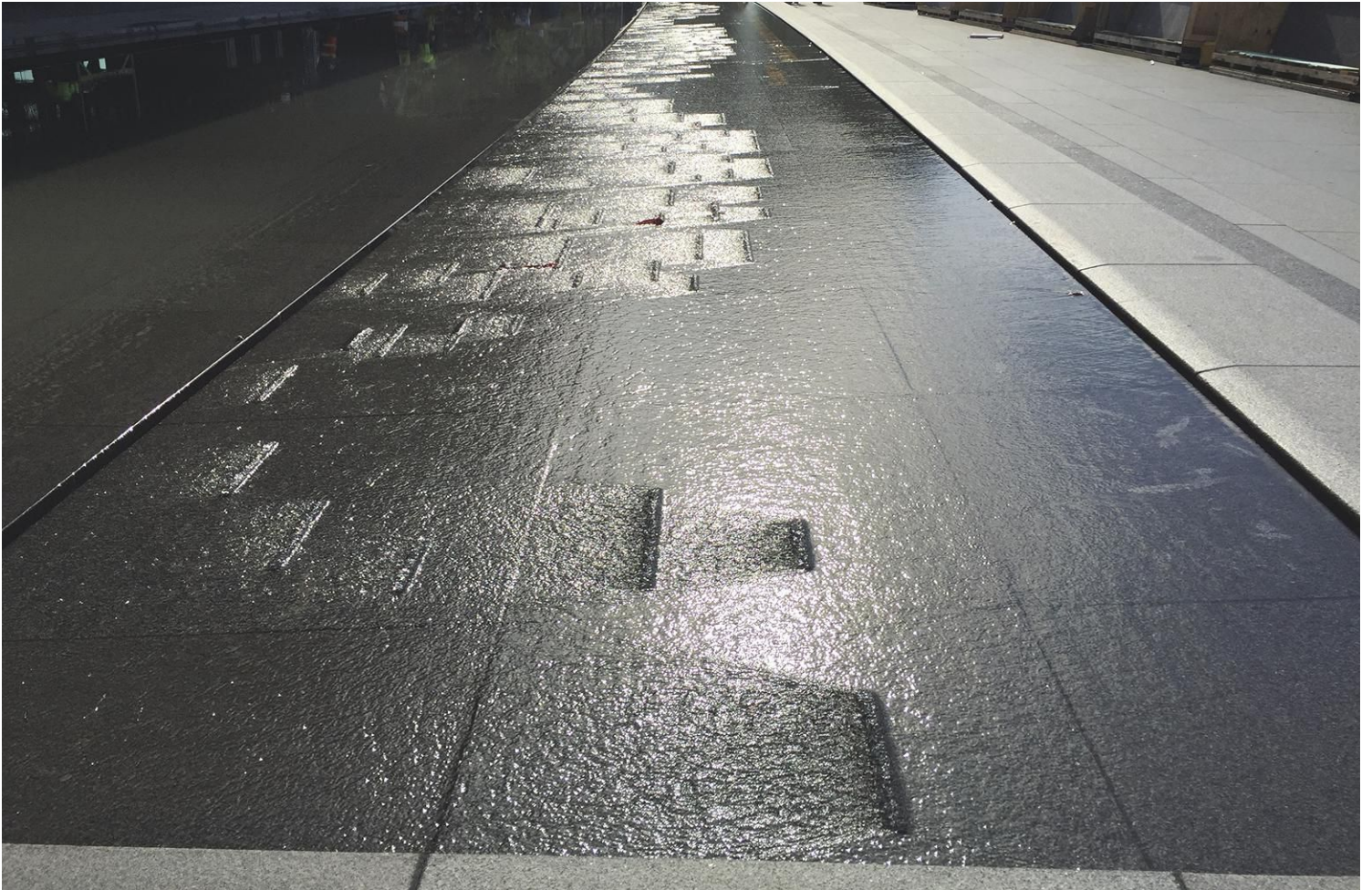
As you get closer, rows of Mesabi pavers laid in a rectangular running bond form a hard surface around the museum's combination oculus and water feature that channels sunlight down into the structure's lower levels.

The stonework on the site includes a mix of thin and thick retaining walls, benches, bollards and pavers, rendered in two kinds of granite in four different finishes. Underneath all the natural stone is a lot of concrete. Rugo said, "A structural concrete slab on grade is typical throughout the site. There's a 6-inch slab with a 2- to 3-inch setting bed of dry pack mortar. And then 2-inch stone paving throughout, 3 inches in some cases."